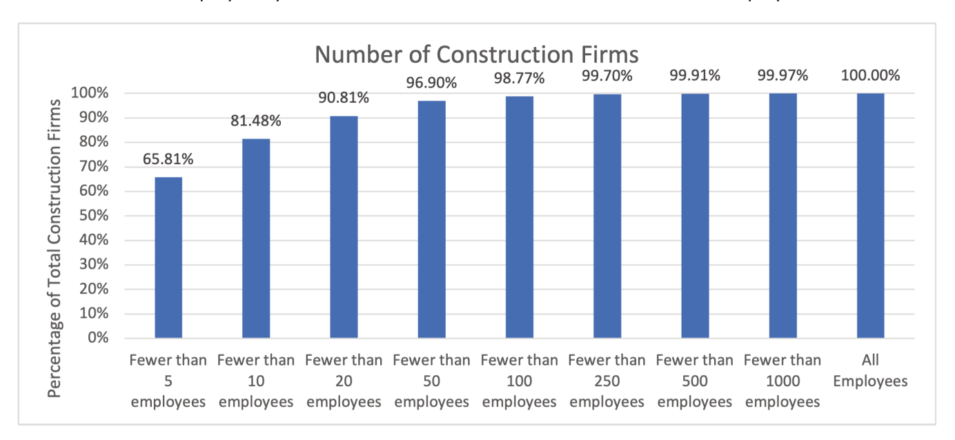
Figure 1: Percent of Construction Firms by Size

While small firms represent most of the construction companies overall, many employees, roughly 4.3 million, are employed by construction firms with between 10 and 249 total employees.